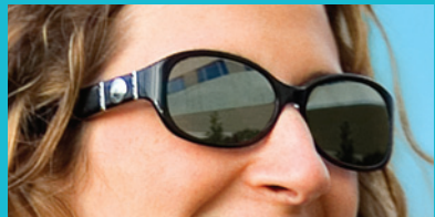
Silver (Gray 3 polarized or solid tint)

Crizal SunShield Mirrors is available in three color options on polarized or solid tinted lenses