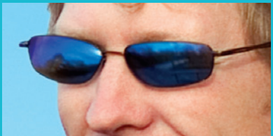
Blue (Gray 3 polarized or solid tint)