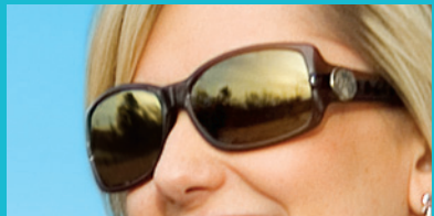
Gold (Brown 3 polarized or solid tint)