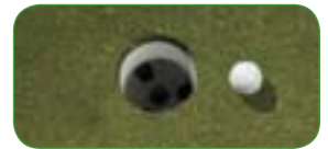
With the GROUND VIEW ADVANTAGE